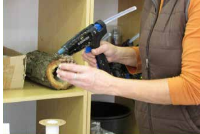
Glue wire of the cone and add to the bouquet.