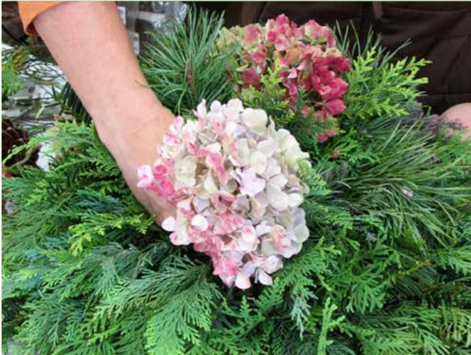
Add hydrangea macrophylla to the bouquet.