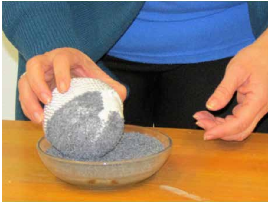
Roll the ball in poppy.