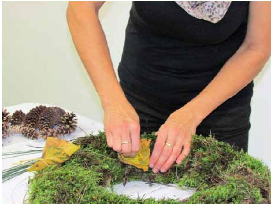
Fix leaves on the wreath by “U” clips.