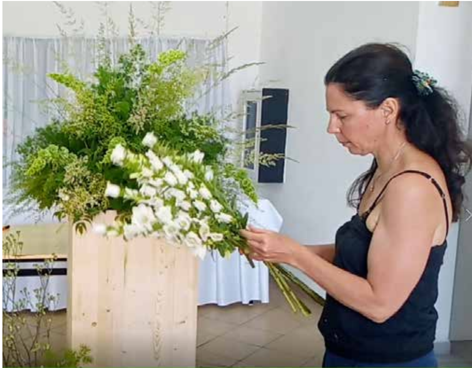
Complementing the arrangement with a campanula.