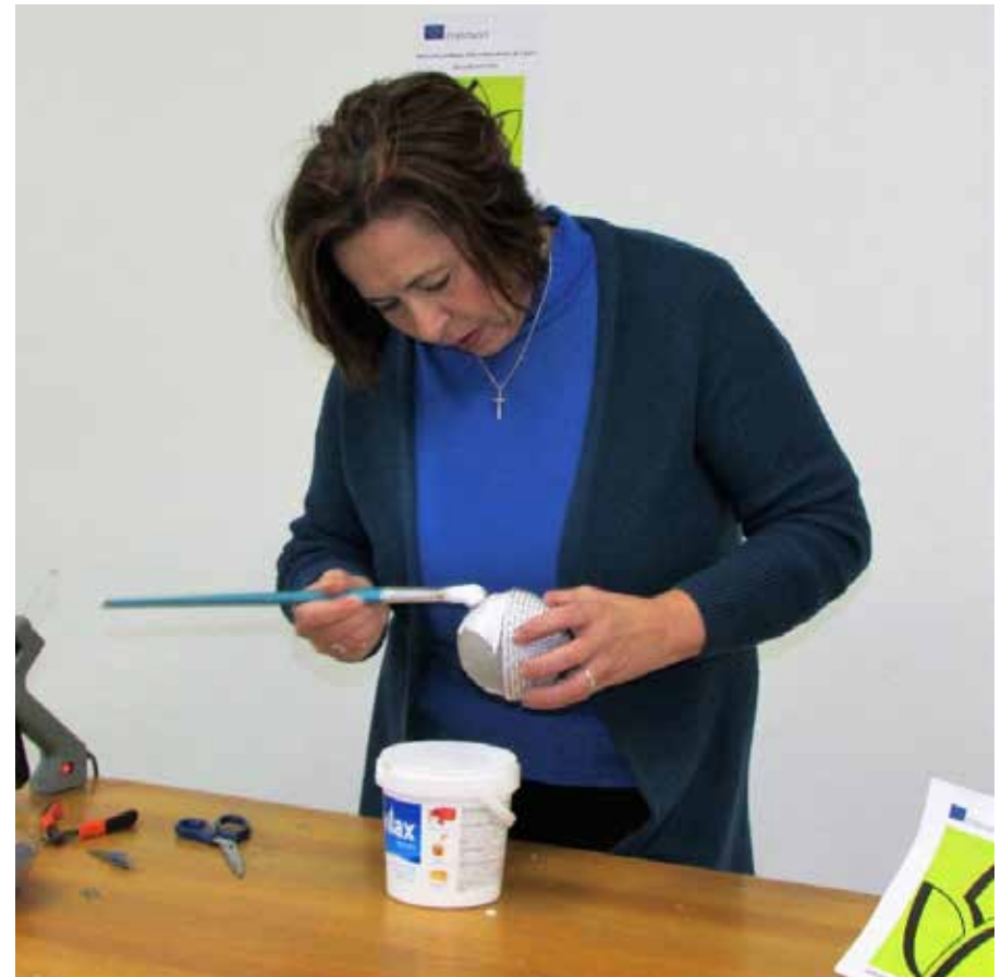
Spread glue on the second half of the ball.