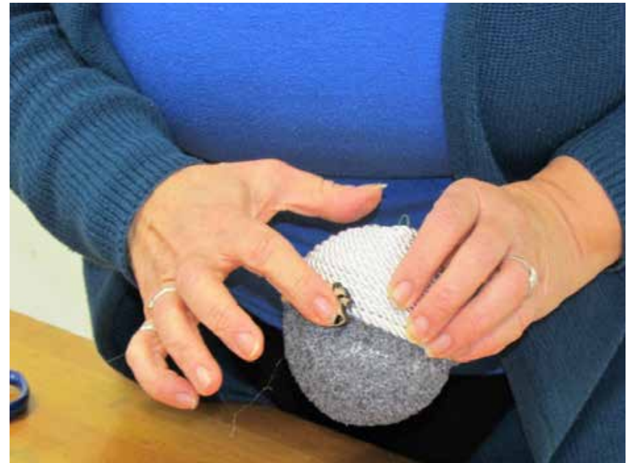
Glue Christmas ornament on the ball.