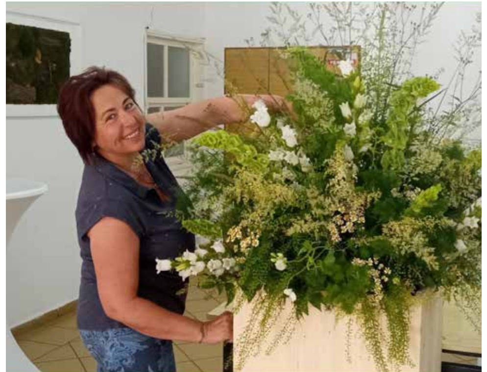
When work is a joy.