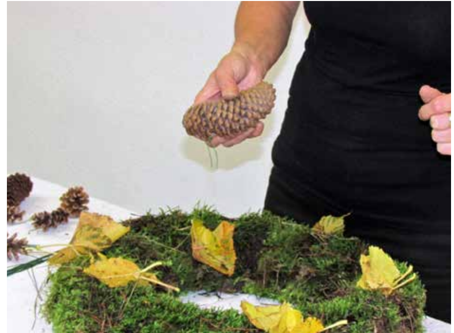
Bind cones with wire and add to the wreath.