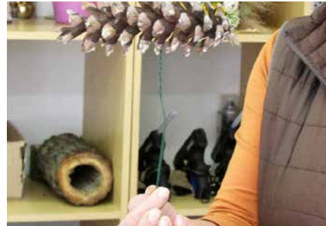
Bind cones with wire.