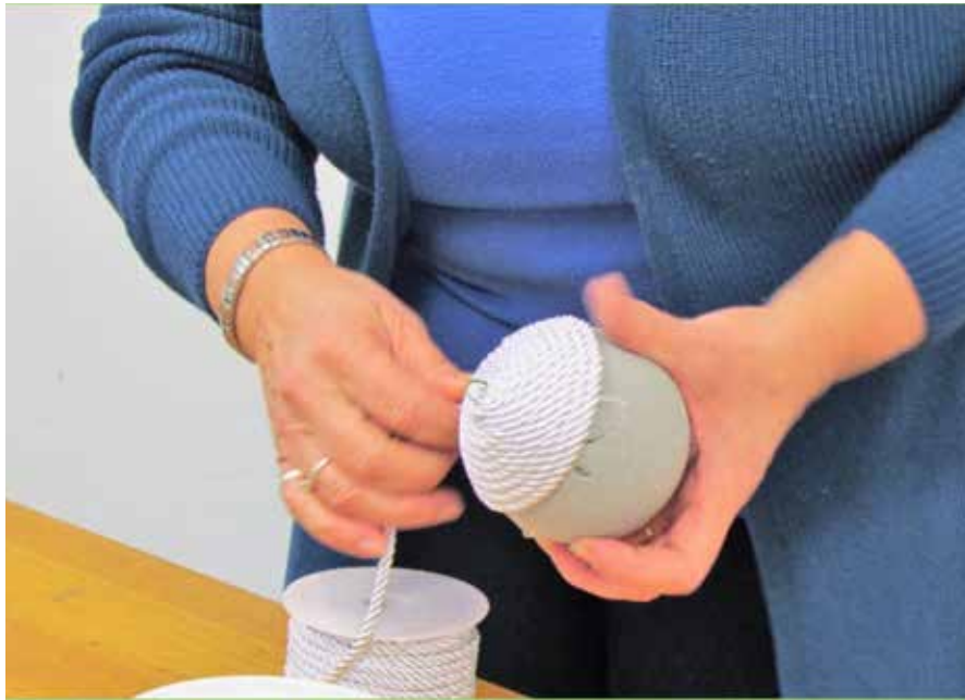
Glue the twisted cord to half of the ball.